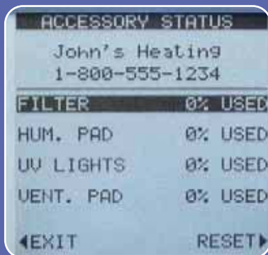
Accessory Status Screen